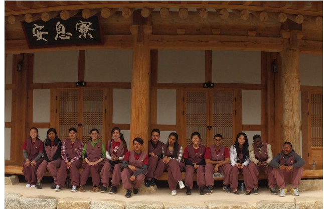
(Youth Ambassadors during temple stay, Seonunsa Temple, Jeollabuk-do, April 14, 2014)

During the study tour to Korea, Project Bridge students visited many places in Korea of historical and social significance, stayed with a host family, and engaged in open dialogue with Koreans.