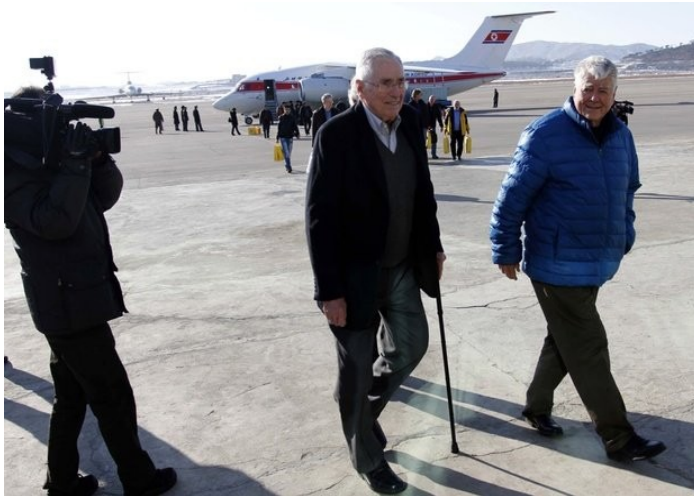
(PCI Chairman Gregg and Pete McCloskey arrive in Pyongyang, February 10, 2014)