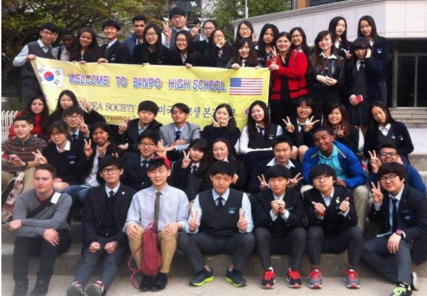
(Youth Ambassadors with Banpo High School Students, Seoul, April 10, 2014)

Project Bridge 2013-2014 culminated in a ten-day study tour of Korea, where Youth Ambassadors explored Korea's cultural, political and economic centers, accompanied by four group leaders and two program coordinators. Project Bridge Los Angeles had 9 workshops before the Study Tour took place from April 10 to April 20, 2014.