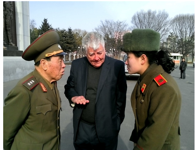
(Two veterans agree on the horror of war, Pyongyang, February 13, 2014)