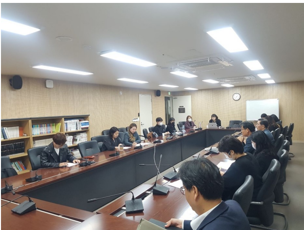
(10th Korea Peace Academy's first lecture, Seoul, Korea, April 6, 2023)

The program will run from April 6 to December 7, 2023.