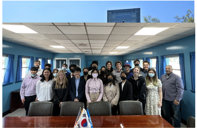
(2022-2023 Youth Ambassador with Daegu Metropolitan City Youth Organization, Gyeongju-si , Korea)