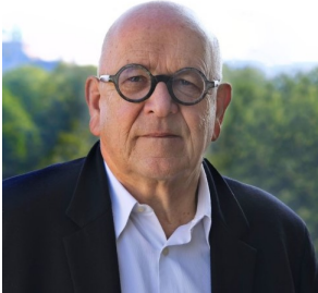
By Glyn Ford / Former Member of the European Parliament (MEP)

For Pyongyang the South going nuclear would be a cause for celebration not consternation. The recent forewarning by President Yoon that Seoul might opt for unilateral nuclear armament was painted as a threat to Pyongyang that would force it to curb its enthusiasm for the continued development of bigger missiles and smaller nukes. This deterrent effect was to resonate with its deliberate conjuncture with Prime Minister Kishida's announced smashing of Tokyo's 1% glass ceiling on military spending with his plan to double the defense budget over the next five to ten years, thus supposedly delivering a pincer movement locking the North in the jaws of a Tokyo-Seoul vice.