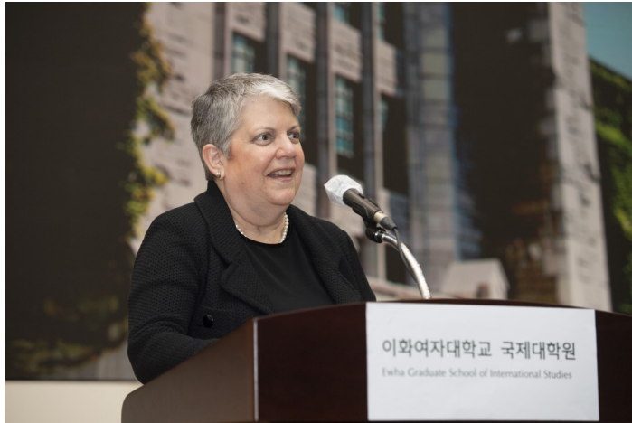
(Sec. Napolitano, Ewha Womans University, Seoul, Korea)

The 5th Annual William J. Perry Lecture Series at Ewha Womans University in Seoul, Korea took place on Thursday, November 4, 2021. This year's guest lecturer, Secretary Janet Napolitano, is a professor of Public Policy and Director of the Center for Security in Politics at University of California, Berkeley. She has served as the president of the University of California from 2013 to 2020, as the US Secretary of Homeland Security from 2009 to 2013, as Governor of Arizona from 2003 to 2009, as Attorney General of Arizona from 1998 to 2003, and as US Attorney for the District of Arizona from 1993 to 1997.