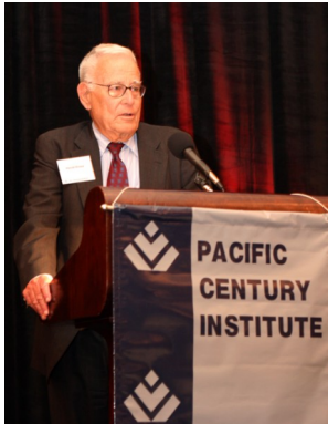
Hon. Harold Brown on February 25, 2010

This year's Pacific Century Institute Award Dinner in February was a great success thanks to the generous help from board members, dinner co-chairs and loyal supporters.