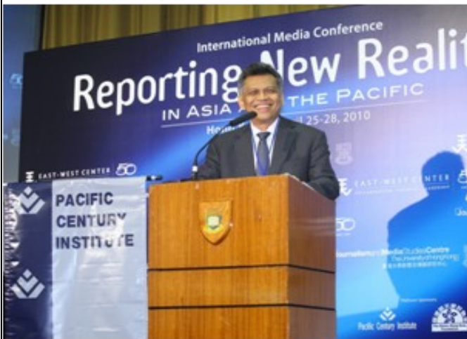
ASEAN Secretary General Surin Pitsuwan speaks at the keynote speech luncheon in Hong Kong on April 26, 2010.