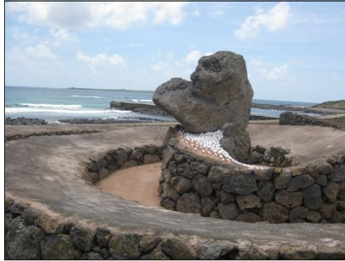
Jeju Pacific Rim Park

US Ambassador Kathleen Stephens said in her speech at the Pacific Rim Park dedication ceremony on Aug. 7, 2010, "The Pacific Rim Park Foundation has promoted people-to-people ties between the United States and other