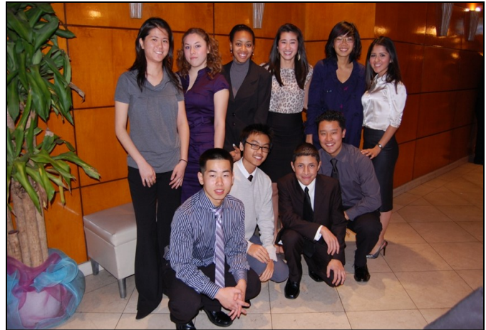
Project Bridge 2009-2010 Youth Ambassadors and Group Leaders at the welcoming dinner on January 14, 2010.

American National Museum and Museum of Tolerance; an exhibition at the Getty Museum to explore the struggle for civil rights; and a weekend retreat at the White Eagle Ranch.