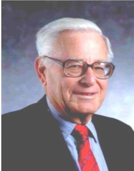
The Honorable Harold Brown 14th U.S. Secretary of Defense

The Pacific Century Institute will honor Dr. Harold Brown on February 25 with its "Building Bridges Award" for his lifelong service to the national security of the United States and its allies as Secretary of Defense under President Jimmy Carter, and his statesmanship in focusing on the crucial issues of the contemporary age.