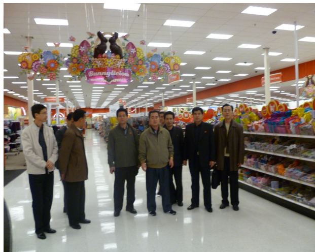
North Korean delegates visit Target store, March 20, 2011.

The group's final stop was San Francisco, March 30-April 3, where it was introduced to the Northern California regional economy through lectures and site visits. A day in Silicon Valley, including visits to Google and Stanford University and meetings with Korean American entrepreneurs and finance and legal experts, highlighted the ingredients that combine to produce an innovation economy. At a large scale family rice farm in Davis, the officials learned about responsible land and water resource management in an agricultural business.