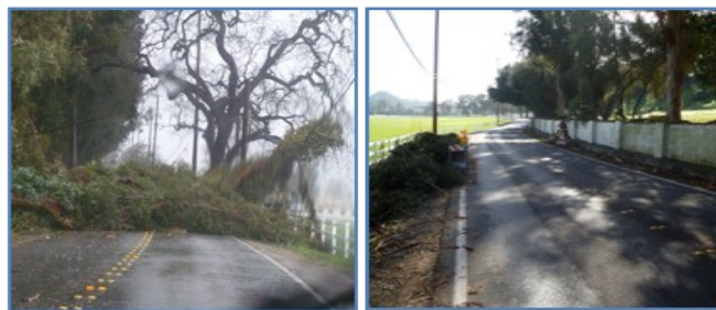
The road was blocked...then, cleared.

The final day of the group in Los Angeles dawned still rainy.